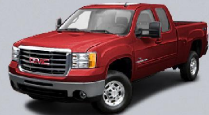
Sierra 2500HD Extended Cab Shown

Purchased at Borcharding GMC, Kings Auto Mall